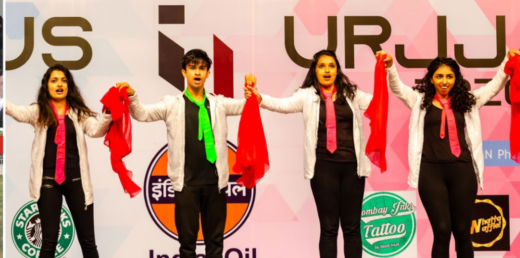
Isthmus - Urjja

SHOBHABEN PRATAPBHAJ PATEL SCHOOL OF PHARMACY & TECHNOLOGY MANAGEMENT