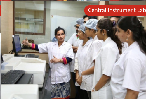
Central Instrument Lab