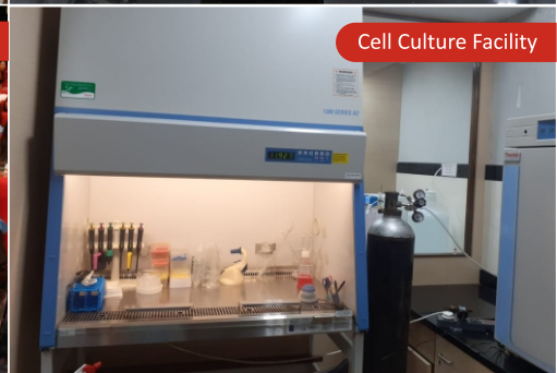
Cell Culture Facility